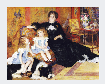
Storge (grek) Familial Love